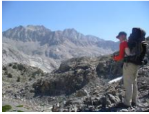
Backpacking in the Sierra Nevada

From water skiing on Cumberland Lake to kayaking in the Florida Keys, high adventure backpacking in the Sierra Nevada to canoeing the Allagash River in northern Maine, we've done it all. These are life changing events that you will remember forever. Our high adventure trips are once a year and require planning and preparation using the skills you learn in our Troop.