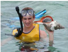
Snorkeling in the Florida Keys

We hold weekly meetings where we work on advancement through the Scout ranks and plan our events. "Be Prepared" is our motto, so we make sure we have the food (we are famous for our cooking), transportation, reservations and other items for a safe and fun environment. Some meetings we might play Frisbee golf, go bowling, or swim at the local university. Other times we have a campout, go whitewater rafting, or backpacking for a weekend.